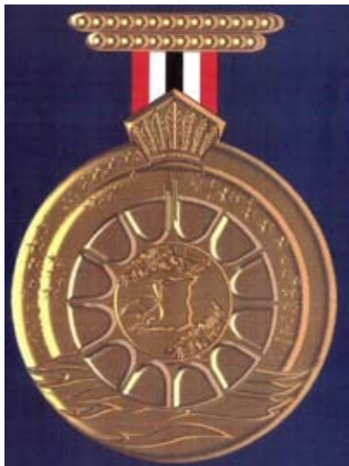
The new medal bears no cross.

It seems to have escaped the notice of Muslims and Hindus that Columbus named their country in recognition of the